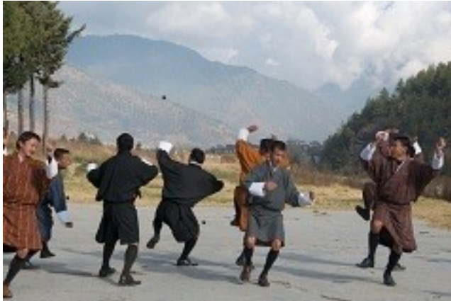
RAPA dancers in rehearsal